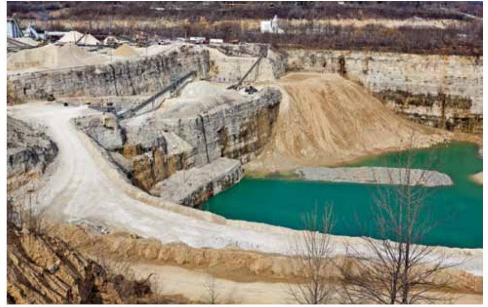
Tailings are an inescapable fact of life in the mining industry.

According to a PricewaterhouseCoopers International Limited report, "Mining 2011: Review of