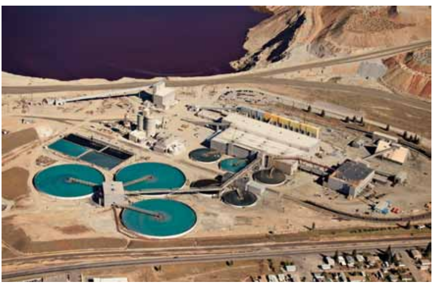
When the retention pond becomes full of tailings-heavy wastewater, the wastewater must be treated and the tailings removed.

retention pond that has been constructed at the mining site.